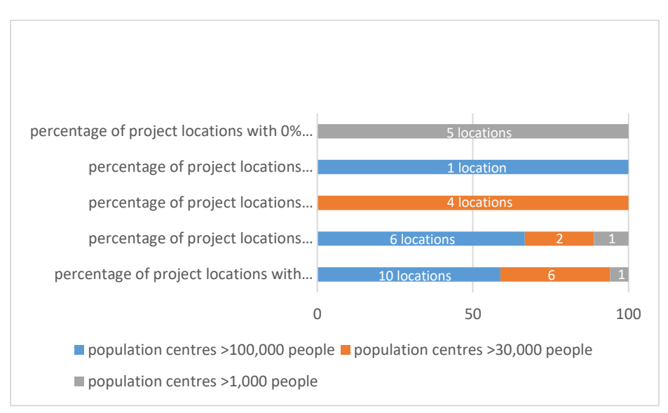
Figure 4: Proximity of Public Transit Stops or Stations to Social Housing, by Population Size.

As seen in Figure 4, public transit is more accessible to those living within social housing in large and medium population centres compared to small ones. In particular, of the 36 PTIF project locations included in the analysis, 17 were large population centres, 12 were medium, and 7 were small. Moreover, the five large population centres of London, Longueuil, Montreal, Ottawa, and Toronto, accounted for 25% of all PTIF projects and at least 85% of social housing units in these locations were within 1,000 metres of public transit stations and stops. This supports the finding that population centres with already high proximity between social housing and public transit are receiving PTIF funding, and that they tended to be large population centres. A consideration for future programming could look at the gap found in this analysis that smaller municipalities aren't always near social housing and public transit.